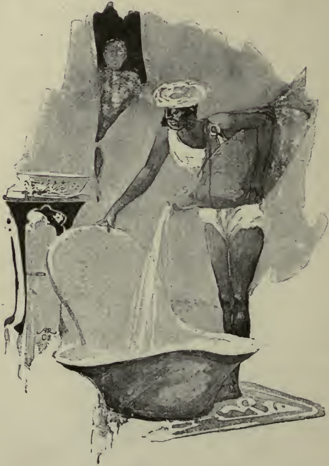
EMPTIED HIS GOATSKIN.

and the lamp, and Radabullub. I knew at once it was Radabullub by the look of